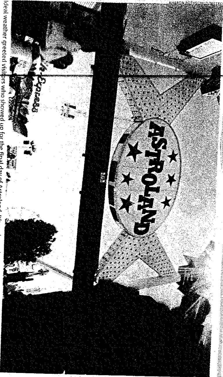
Ideal weather greeted visitors who showed up for the final day of Astroland. It's unclear what will replace the amusement park.